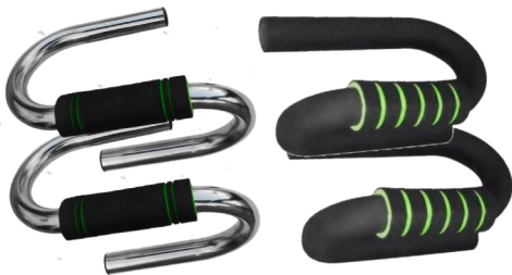
S SHAPE PUSH-UP BARS