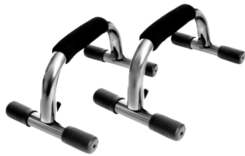
REGULAR PUSH-UP BAR