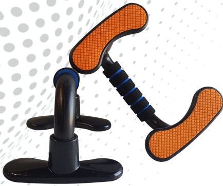
PVC- PUSH-UP BARS